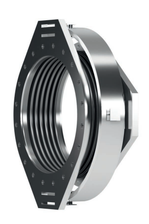
MFC Gimbal expansion joint with flanges.